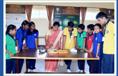
Atal Tinkering Lab