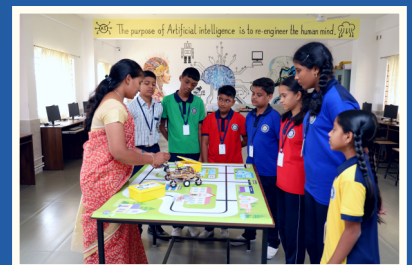
Artificial Intelligence and Robotics