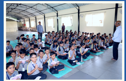
Bhagavad Geeta, Chanting